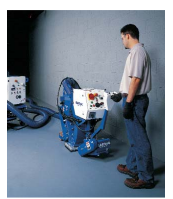
1-10D with 6-54 dust collector